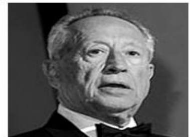
Thimio Mitropoulos Patron and former Secretary-General of the International Maritime Organisation (IMO)